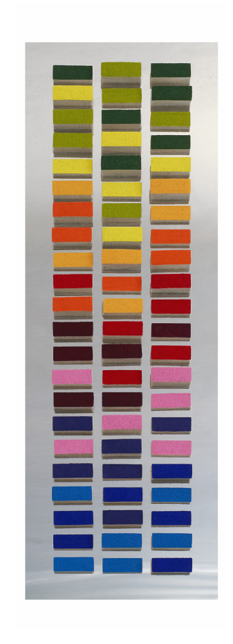
HK - 1 BLUE Mirror-Finish Stainless Steel and Felt 40 x 160 cm