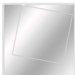
St Petersburg Art Collection Mirrored works SPDW2014 Attachment 1